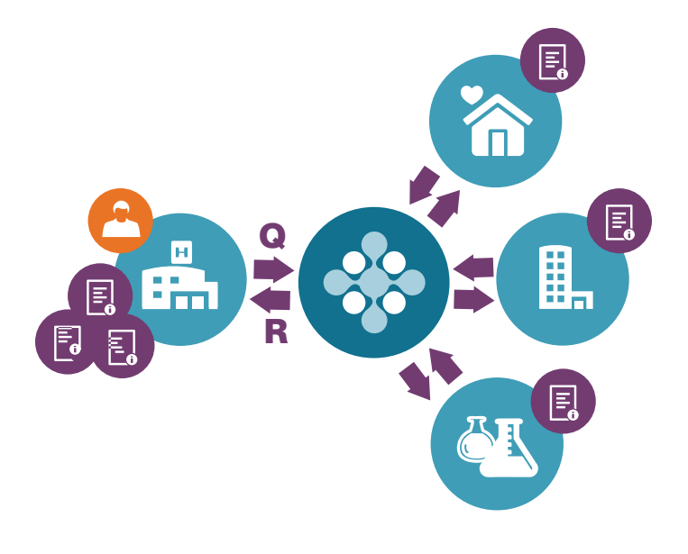
Data Query & Retrieval enables caregivers to receive the patient data they need, when and where they need it.

The key value of a strong identifier is stored in CommonWell as a hashed value for use in search algorithms. It is never returned in CommonWell encrypted responses.