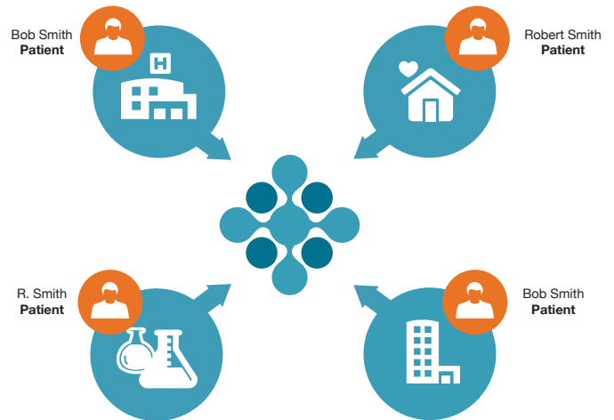
Person Enrollment uniquely identifies each individual in the CommonWell network.

CommonWell supports consumer-driven preferences for data sharing. Users of connected systems (for example, front-desk staff at a clinic) enroll an individual into CommonWell with that person's cooperation, ideally using a strong identifier (like a driver's license) to ensure that their records are accurately linked. This action can be accomplished through their local HIT system's interface or through an optional CommonWell-provided Web interface.