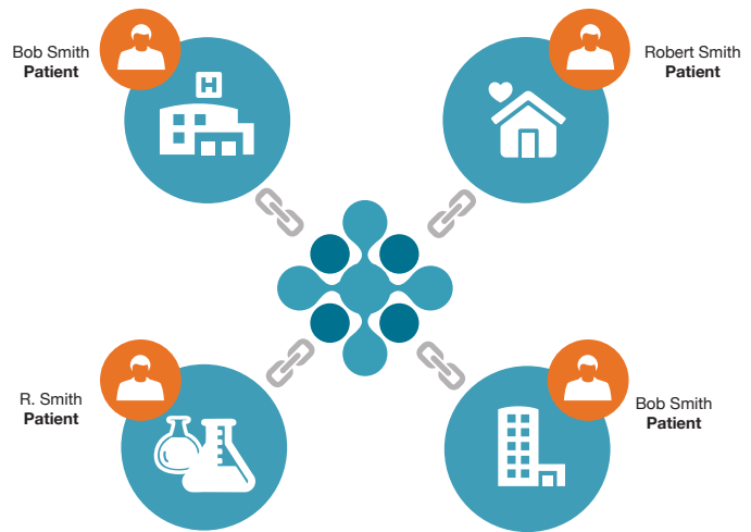
Patient Identification & Linking connects each individual's clinical records across care settings.

These states are referred to as Levels of Link Assurance , or LOLA , by CommonWell.