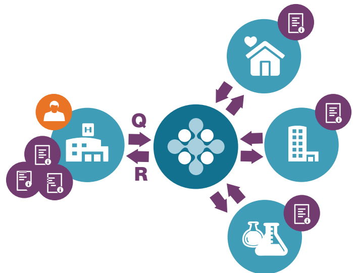
Data Query & Retrieval enables caregivers to receive the patient data they need, when and where they need it.

While CommonWell itself never stores clinical data, the platform uses a layered security approach to help ensure the safety of the clinical and demographic data being transferred. Client certificates, Java Web Tokens, and SAML are used to authenticate a given Edge System to the CommonWell services. Only trusted systems are permitted to execute requests against the platform.